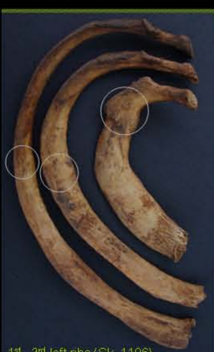
1 st - 3 rd left ribs (Sk. 1106)

Rib fractures are a frequent origin of pulmonary complications 11,18 , specially pneumonia that commonly causes death in individuals with broken ribs 19-21 . Medical reports 21 shows that pneumonia incidence increases with higher number of ribs fractured. In fact, the present study reveals that 3 out of 4 individuals with 8 ribs fractured (the highest value observed) died from pneumonia.