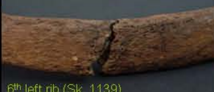
6 th left rib (Sk. 1139)