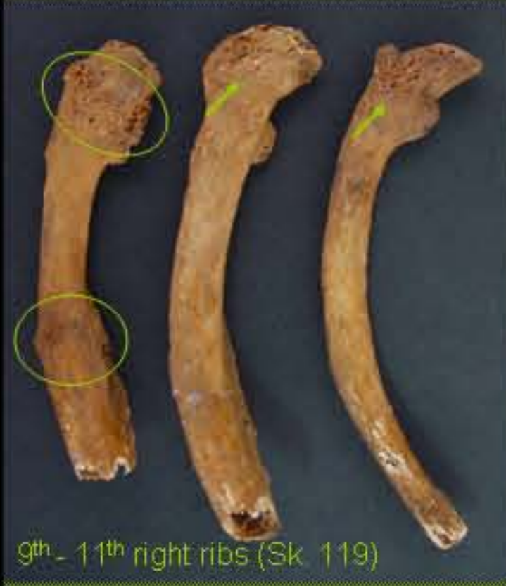
9 th - 11 th right ribs (Sk. 119)