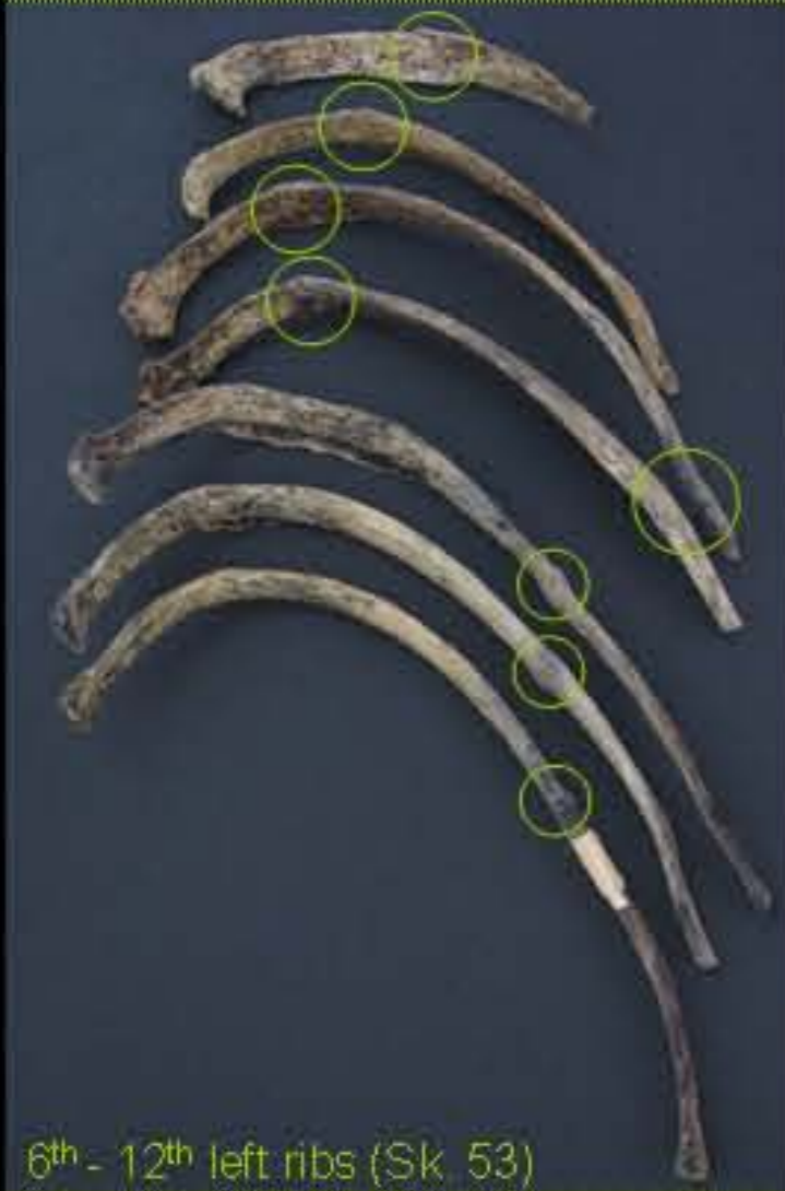
6 th - 12 th left ribs (Sk. 53)