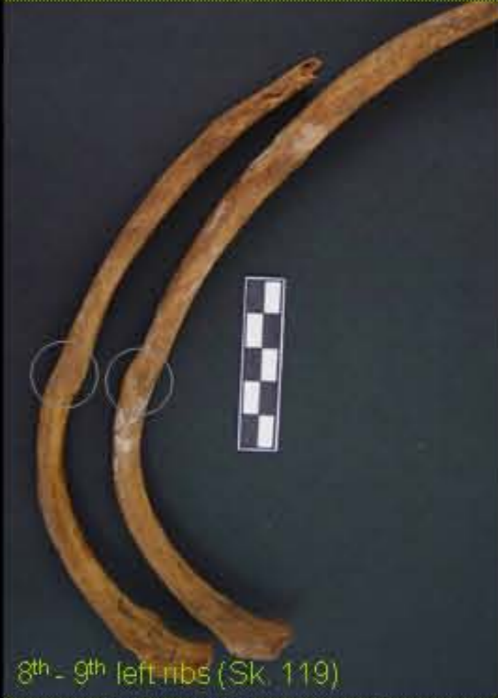
8 th - 9 th left ribs (Sk. 119)