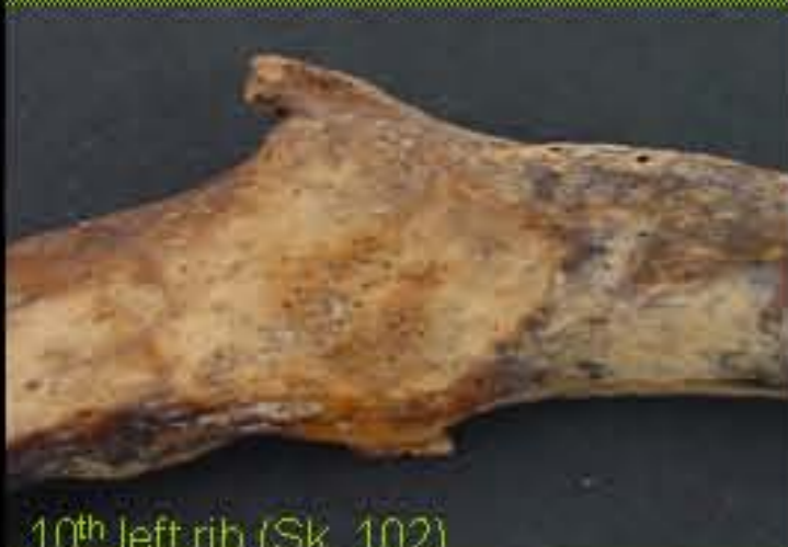
10 th left rib (Sk. 102)