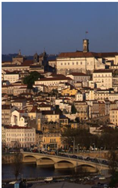
View of Coimbra old town